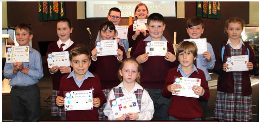
Assembly Awards Week 6