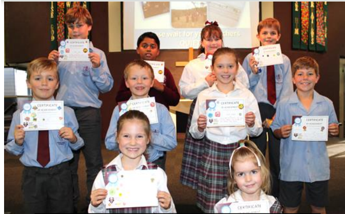
Assembly Awards Week 5